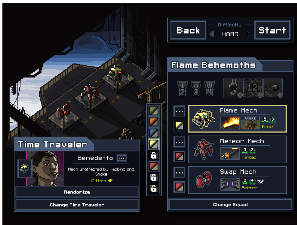
Figure 5: An instance of the pre-deployment phase of Into the Breach .

In the deployment phase proper (see Figure 6), the player is given an aesthetic indication (i.e. particularly bright tiles) as to which areas of the game terrain are possible to be used for the deployment of units. As previously observed, the decisions the players take in this phase of Into the Breach are revocable, and can be indefinitely reconsidered and retaken.