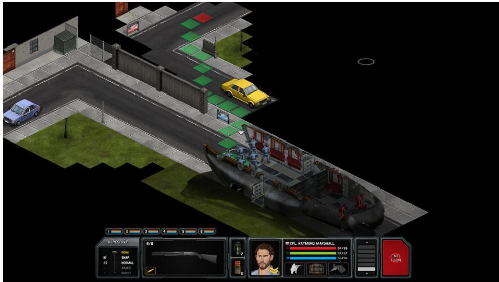
Figure 4: Units ready for deployment in Xenonauts . The green and red square indicate positions available for deployment, while the black portion of the screen represents the fog of war.

While in this paper we focus exclusively on turn-based games (due to their direct genealogical link with analog games), it should be noted that deployment is a relevant feature in real-time games as well. In these games the deployment of units is usually connected with what is commonly known as the ‘build order’, which can be framed as a form of continuous deployment that happens consistently throughout the game. In other words, real-time strategy games can be understood as a peculiar sort of deployment-only games, in which this action holds specific strategic implications that should be discussed in their own right.