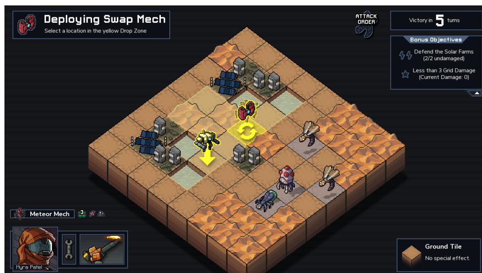
Figure 6: With rare exceptions, units in Into the Breach can only be deployed on highlighted areas. Their position can be reconsidered and adjusted before confirming the chosen deployment configuration.

An interesting analogy can be drawn between deployment phases and another phase of the gameplay of digital games that can also be considered transitional: character creation in RPG digital games. Similar to other preliminary, transitional phases, during character creation the players are prompted to choose among a limited amount of options. Some of those options are relevant to in-game performance (usually concerning race, class, and gender), while a wide variety of aesthetic choices with no functional relevance are solely designed to allow the players some degree of aesthetic self-fashioning. Among these, it might suffice to mention the character's hairstyle, the shape of the bridge of her nose, the eventual presence and position of tattoos, etc. Existing literature in cognitive and behavioural approaches to game studies established a correlation between the possibility of making expressive choices concerning players' avatars and the level of empathy that the players will feel towards them (Koehne et al. 2013; Turkay & Kinzer 2014). The same can certainly be argued for the possibilities to personalize the name of a battalion, its distinguishing colours, insignia, etc.