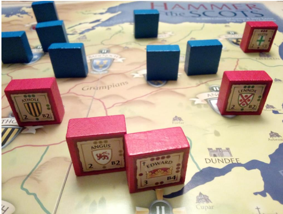
Figure 1: In block wargames such as Hammer of the Scots (Columbia Games 2002) the players cannot see the strength of enemy units.