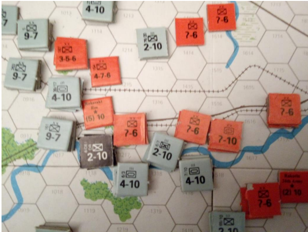
Figure 2: In Panzergruppe Guderian Russian units are marked with a question mark, since at the time of deployment their strength is unknown to both players.